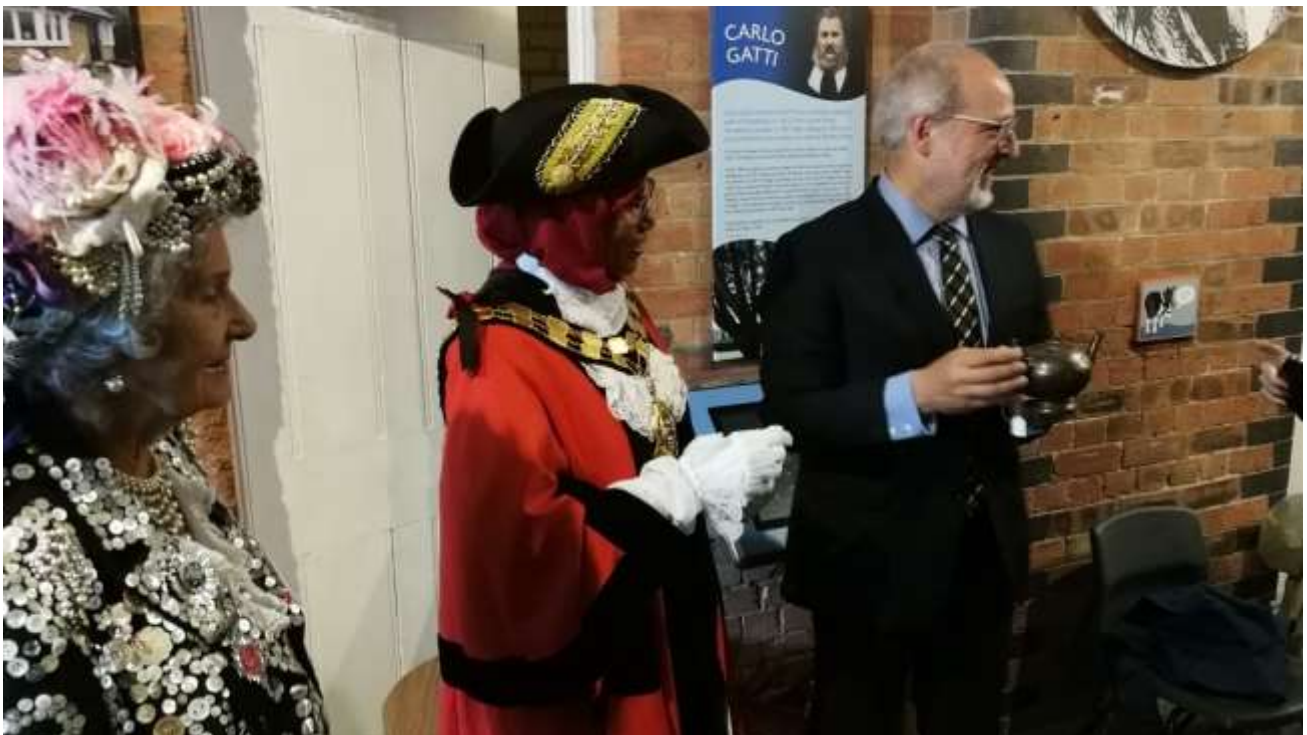
The Pearly Queen, The Mayor of Islington, and the Ambassador of Switzerland. The Ambassador holds a teapot from one of Gatti’s restaurants, put on display in 2019.

The last weekend of July 2019 was one of the highlights of the year. We had daytime activities for families including ice cream making demonstrations, and a cream tea was served to guests and members of the public on the first floor of the museum in the afternoon of the Saturday. His